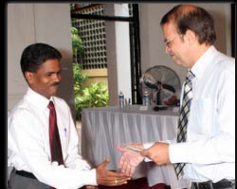
100 th Anniversary Members Celebration