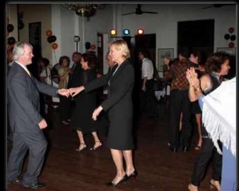
100 th Anniversary Celebration at St. Nikolaas' Home