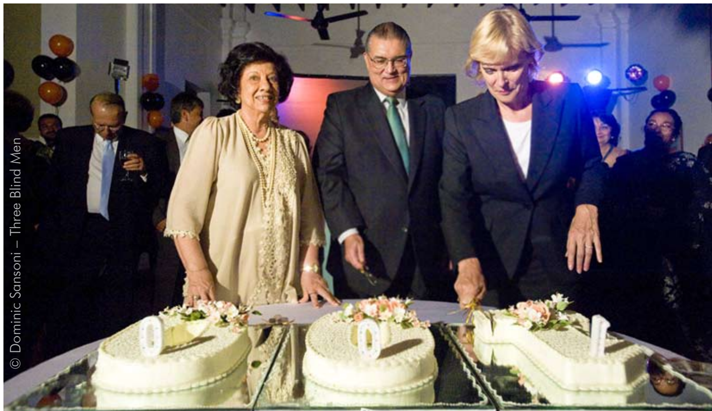
© Dominic Sansoni – Three Blind Men