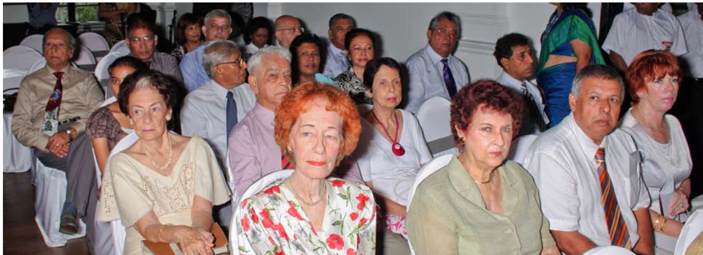
Guests at the ceremony to launch the commemorative stamp

a special occasion such as this. However, I am required to be in Parliament on an important matter and ask you to please excuse me very shortly.