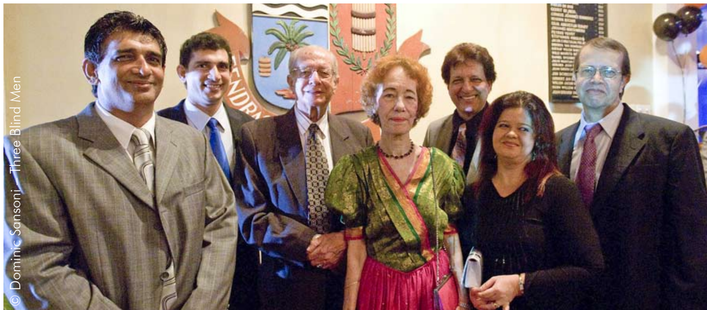
© Dominic Sansoni - Three Blind Men

active participation and absolute passion for the DBU.